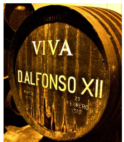
Bota dates back to 1872